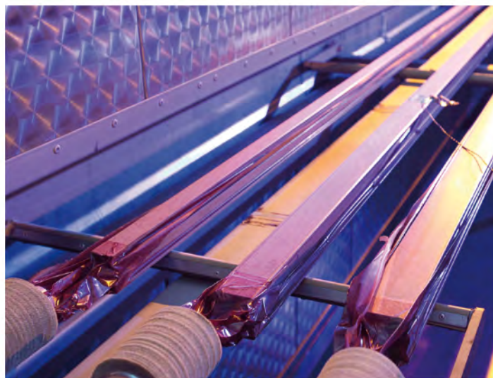
Profile wrapped connected to vacuum system to obtain contact of the film to the surface